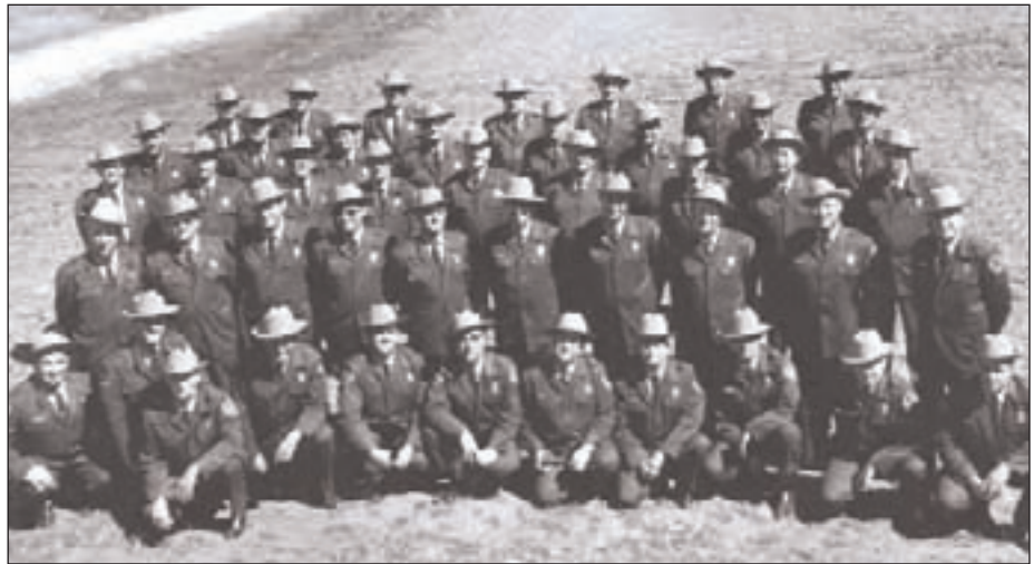
This photo from the 1960s shows the entire Law Enforcement Division. Throughout the history of the division, officers have done more than enforce laws, helping with wildlife and fishery work, and leading the way in the Hunter Education Program.

concerning the natural resources they were to protect. A legislative act of 1927 authorized the first requirement of resident fishing licenses for males only, between the ages of 18 and 70.