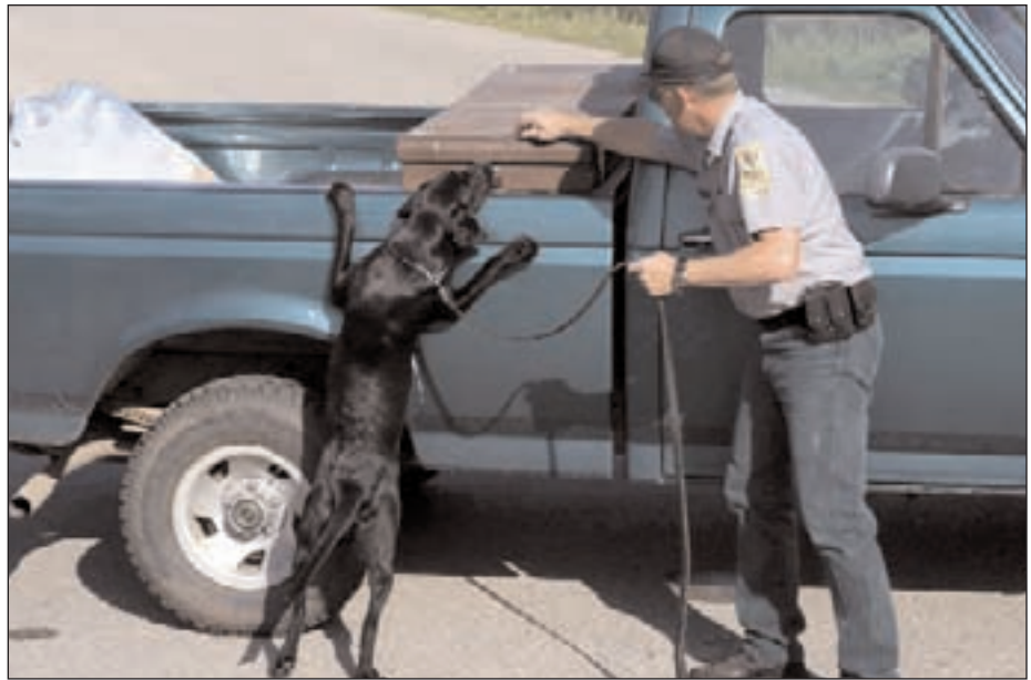
Four KDWP officers and their dogs completed training in 2002. The dogs are trained to detect hidden game meat, hidden firearms or spent hulls, and track suspects.

In 1987, Governor Mike Hayden merged the Kansas Fish and Game Commission with the Kansas State Park and Resource Authority, to form the Kansas Department of Wildlife and Parks. This merger has resulted in 166 certified law enforcement natural resource officers currently employed by the Department. These officers operate in the Law Enforcement and Parks divisions. Public land