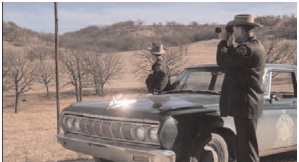
The first paid officers, called special deputy wardens, were hired in 1921. The photo on Page 15 shows the department's entire officer crew in 1928. By the 1960s, when the photo above was taken, there were approximately 45 officers.

It was during this time that deputy wardens collected $10 fines for violations and remitted them to the Fish and Game office where the money was entered into the Fish and Game Fee Fund. This fund was used in part to obtain the first patrol vehicles, consisting of four Ford Coupes and one Hudson Coach. An extra motor for these vehicles was kept at the Pratt Fish Hatchery for transfer to an automobile when needed. The