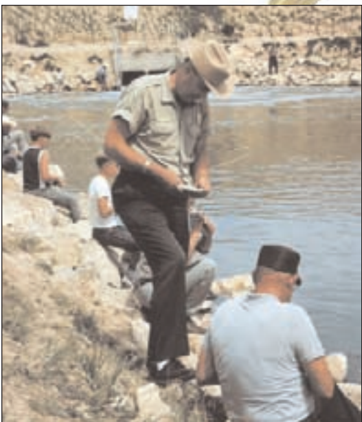
As reservoirs were built throughout the 1950s and 1960s, the officers' jobs changed. The officer above checks licenses at Lovewell Reservoir.

In 1927, the Kansas Forestry, Fish, and Game Commission was organized and gained full control over the Department. The newly-formed Commission had a salaried staff of 10 state deputy game wardens and 375 unsalaried county deputy game wardens. Salaried wardens were paid $100 to $150 per month, depending on their experience and ability. Ten Kansas districts were established, with a salaried warden assigned to each district. At this time, it was recognized that wardens needed to acquire certain knowledge and skills